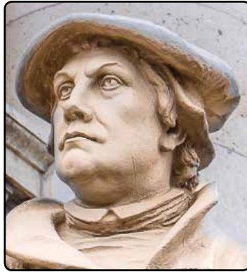
MARTIN LUTHER: THE IDEA THAT CHANGED THE WORLD 12 TUESDAY AT 7:00PM