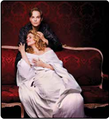
GREAT PERFORMANCES AT THE MET: DER ROSEKAVALIER 3 SUNDAY AT 3:00PM