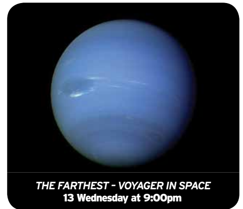
THE FARTHEST - VOYAGER IN SPACE 13 Wednesday at 9:00pm