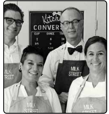
CHRISTOPHER KIMBALL'S MILK STREET TELEVISION 16 SATURDAY AT 11:30AM