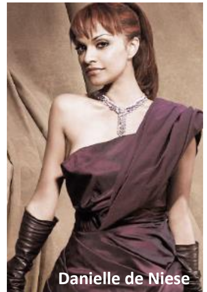
Danielle de Niese

9:00 Great Performances: Bel Canto from Chicago Lyric Opera Experience composer Jimmy Lopez and Pulitzer Prize-winning playwright Nilo Cruz' operatic adaptation of Ann Patchett's best-selling novel inspired by a true-life hostage crisis in Lima, Peru, with soprano Danielle de Niese.